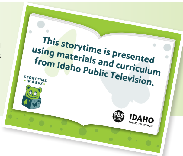
Photo Release Page 17

We ask that you please display the enclosed sign prominently during storytimes where you are utilizing the materials provided in the program. Displaying this sign is a part of the Memorandum of Understanding signed by your library to participate in this program. Download more signs.