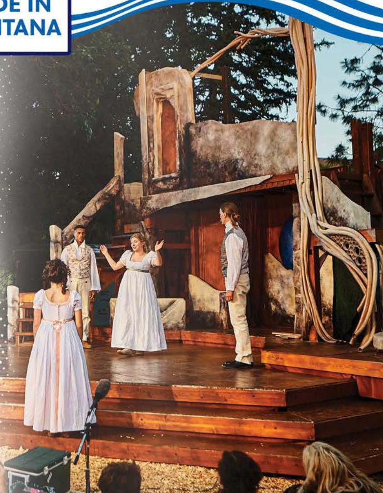
"Montana Shakespeare in the Parks"

Bard in the Backcountry chronicles a summer with "Montana Shakespeare in the Parks," a professional theater company based in Bozeman, Montana. Viewers get a behind-the-scenes look at the ten actors on tour as they cover over sixty-five hundred miles to perform Shakespeare in the rural towns of this vast region. Along the way they encounter an array of characters, many of whom have been watching Shakespeare every summer for over forty years. We learn about the teamwork required to deliver a performance every evening in a new town and how the actors are also their own drivers, roadies, make-up artists, and set builders. Bard in the Backcountry reveals the mutual impact the tour has on the lives of these young actors and the people who put in the effort to bring Shakespeare to town. This journey provides a glimpse of the relevance that classic Shakespearean theater still holds in the lives of everyday people across the region.