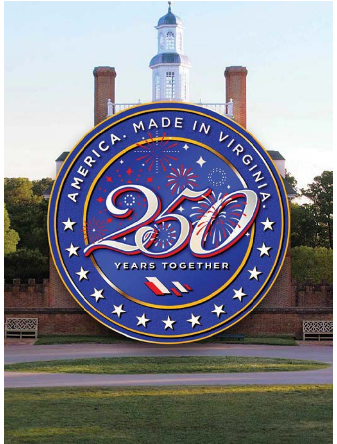
"America Made In Virginia: 250 Years Together" Key Art

The future of international cooperation in space is thrown into question.