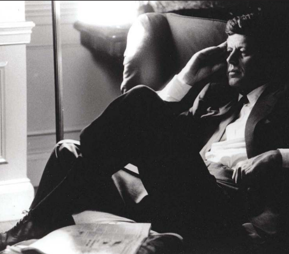
Senator John F. Kennedy in Boston, 1957.