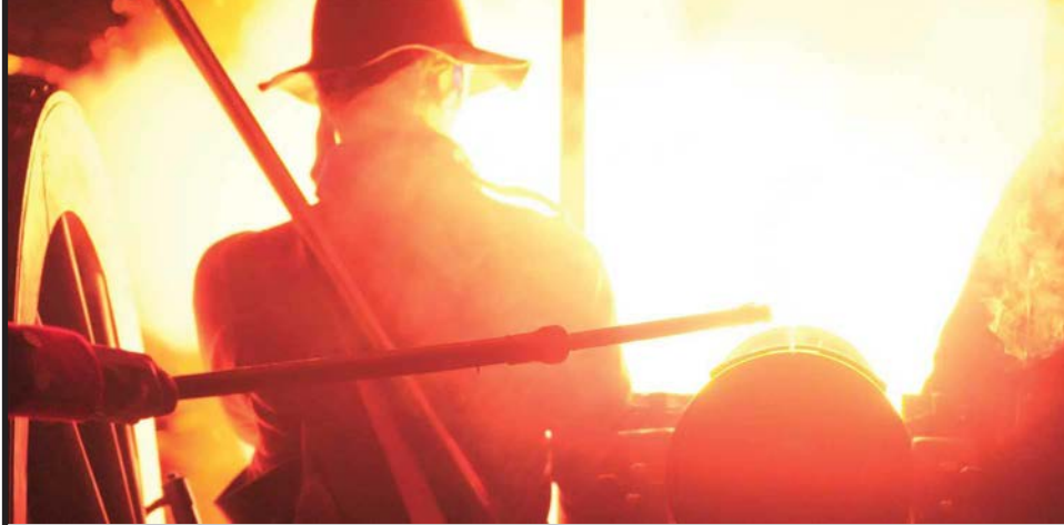
Cannon Firing - NOVA "Revolutionary War Weapons"