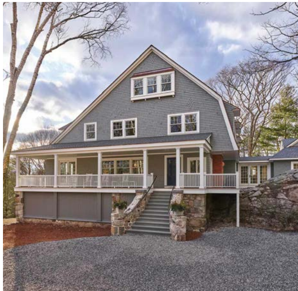
The Cape Ann Project.