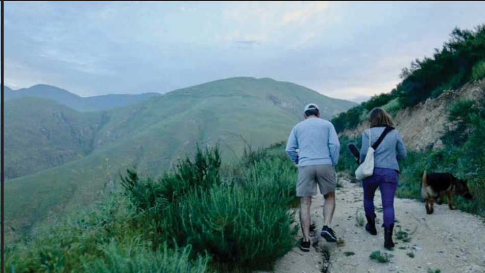
INDEPENDENT LENS "Flood"