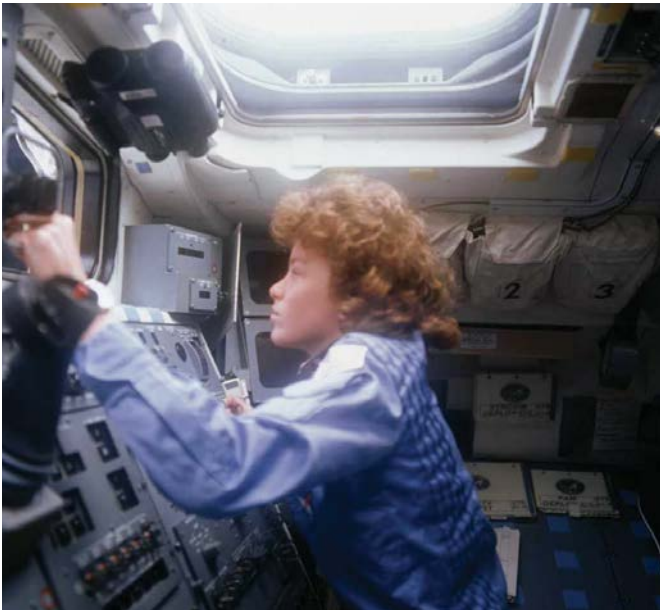
Anna Fisher operates the mechanical arm used to retrieve malfunctioning satellites from orbit during Space Shuttle Discovery flight STS-51-A.

Cover: Daniel Tani during EVA, Expedition 16 mission aboard the International Space Station (ISS). January 2008. (ONCE UPON A TIME IN SPACE)