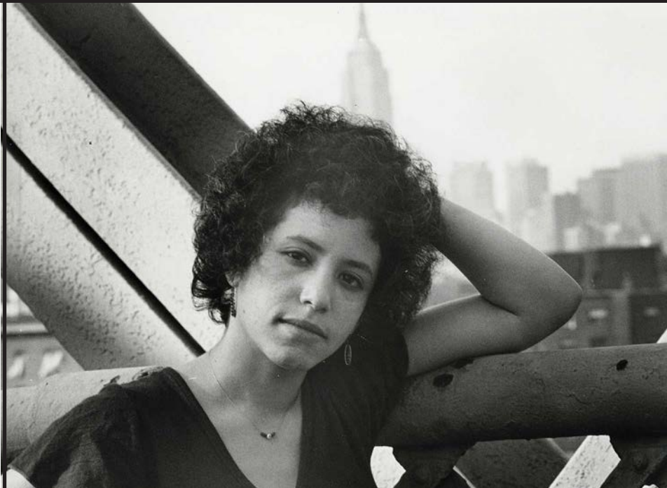
AMERICAN MASTERS Janis Ian