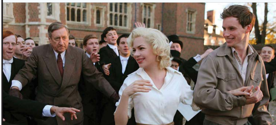
Michelle Williams and Eddie Redmayne in MY WEEK WITH MARILYN (2011).

Colin Clark, an employee of Sir Laurence Olivier, documents the tense interaction between Olivier and Marilyn Monroe during the production, in 1957, of The Prince and the Showgirl .