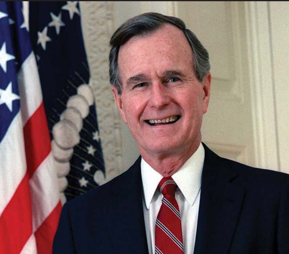
George H. W. Bush, the 41st president of the United States.