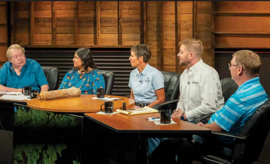
Montana AG Live