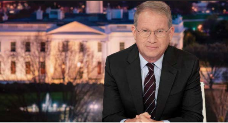
Washington Week with The Atlantic.