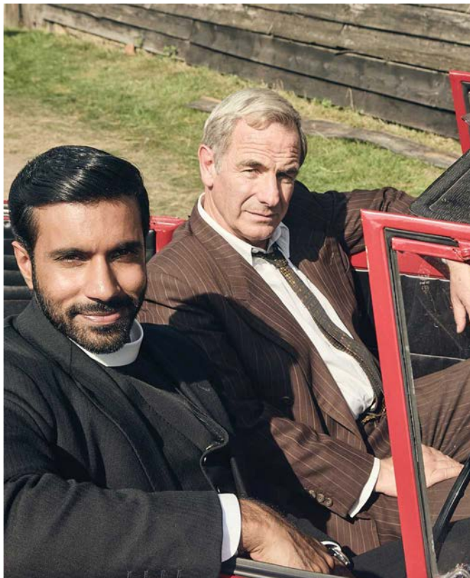
GRANTCHESTER ON MASTERPIECE