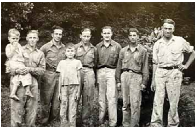
Held in Minnesota: Untold WWII POW Stories 597,853 views on YouTube since Memorial Day

You'll often hear us say, we do what we do for you, but we couldn't do it without you. While that's never been truer, one of the things we are most proud of in our sixty years is telling your stories. These stories are viewed not only locally, but regionally and often times with the world. We are honored to be a part of your story and hope to continue to be for sixty more years to come.